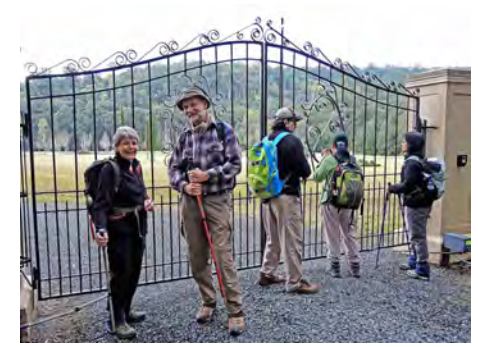
Looking through the gate at an interesting property on Soldiers Road