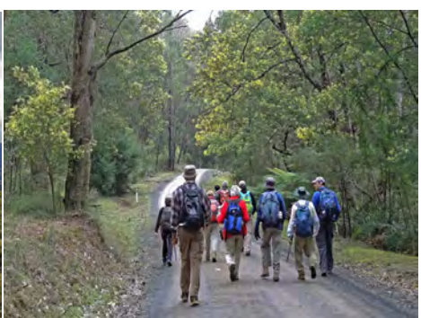
Enjoying the scenery the flora & fungi