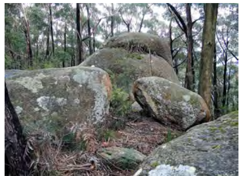
Some of the rocks at the Fire Tower