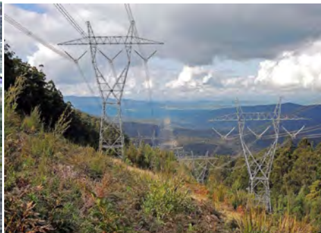
The views from the Powerlines